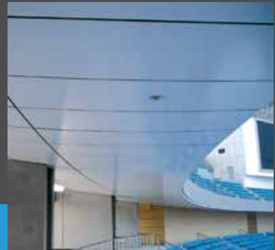
Suzhou Sport Stadium Sport Centre Suzhou, China