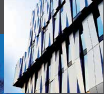
Uppsala Concert & Congress Hall Uppsala, Sweden

The elegant façade is made up of asymmetrically skewed metal cassettes to evoke the essence of a multi faceted crystal. ALUCOBOND® is chosen for its high initial stability and rigidity that allows for a plane and sharp-edged layout as a contrasting but stable backdrop to the varied play of the cassettes.