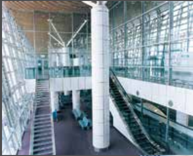
Kuala Lumpur International Airport Asia's Major Aviation Hub Sepang, Malaysia

Being the country's biggest and most prestigious project, the KLIA is captivating in size, sophistication and architectural grace. At the Main Terminal Building and Contact Pier, the interior is clad for a touch of class and includes about 2000 circular columns of various diameter.