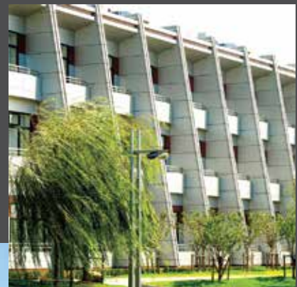
Shanghai National Accounting Institute Education in Accounting Shanghai, China

Set in a garden backdrop, the sprawling complex consists of 11 separate buildings housing a host of facilities connected by walkways. Due to a tight timeline, the ALUCOBOND® 'Hook-On' system with open joints was the best solution for the cladding of its beautiful façade.