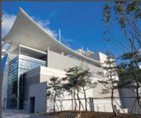
Suseong Culture & Art Hall Deagu, Korea

The elegant façade is made up of asymmetrically skewed metal cassettes to evoke the essence of a multi faceted crystal. ALUCOBOND® is chosen for its high initial stability and rigidity that allows for a plane and sharp-edged layout as a contrasting but stable backdrop to the varied play of the cassettes.