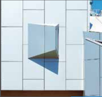
Melbourne University School of Botany Education in Plant Science Melbourne, Australia

Being at the forefront of research, the university's contemporary architecture is characterized by the clever use of ALUCOBOND® cladding, glazing and glazed brickwork to create an intricately geometric and fascinating façade.