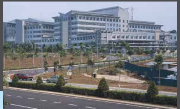
Serdang Hospital Government Medical Centre Selangor, Malaysia