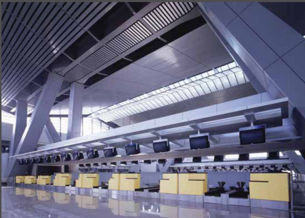
Ninoy Aquino International Airport Int. Aviation Hub Manila, Philippines

The airport's Terminal 3 is an ultra modern facility designed by skidmore, Owings and Merrill ( SOM ) with ALUCOBOND® dressing its check in counters, column structures and ceiling features.