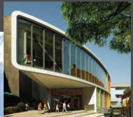
Stadtgalerie Heilbronn Shopping Centre in Heart of the City Heilbronn, Germany

Given the historical city surroundings, the structure successfully integrates two different architectural styles through variations of cubic straight edges and organic spherical curves to the facade.