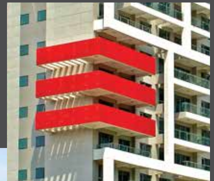
Lu Jiazui Central Apartment Luxury Residential Estate Shanghai, China