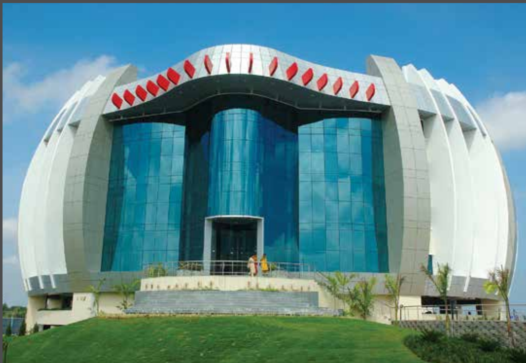
Krisp IT Park Software Technology Chennai, India

A state-of-the-art office complex that has been constructed to house incubators and innovation companies that is abreast of the IT phenomenon. Its curving buttressed columns and fascias are faced with ALUCOBOND® to give a charming bulge to the building.