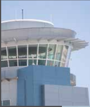
McCarran International Airport Int. Aviation Hub Las Vegas, NV

The airport extension sports a highly reflective façade that mirrors the sky and contrasts with the predominantly earthy tones of the airport and its surroundings. The dry seal rain screen system maintains a smooth clean look that is lasting through the years.