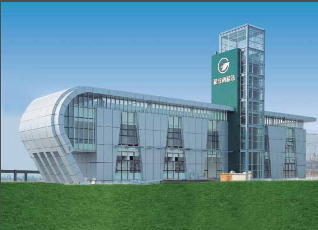
Tianjin Bus Station City Bus Terminal Tianjin, China

The busy station presented an architectural exercise in simplicity with its box building with chamfered walls, curtain wall glass, aluminium cladding as well as boldly exposed vertical glass structure atop the roof.